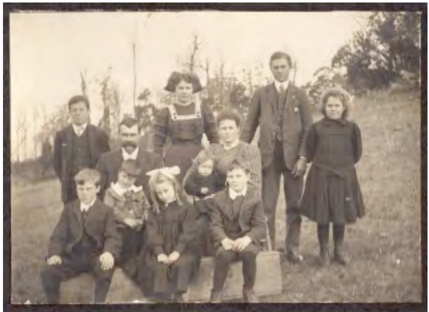
Gray family c1907